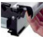
6 Trigger Lock drawer system keeps drawers in place and opens with a natural pull operation. All drawers feature Auto Return, which snaps the drawers closed in the final inches of operation