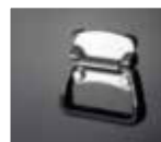
7 High strength side lift handles are integrated into the box wall for added durability and lift capacity