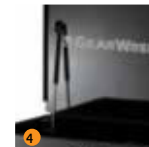
4 Dual gas shocks on lids offer support and easily controlled closure