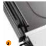
3 Formed with rolled over drawer walls for added strength and rigidity