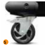
5 One set of locking casters on all cabinets and carts