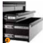
2 Double Ball-Bearing construction offers exceptional drawer load capacity of 30kg and easy slide action. All drawers come with drawer liners